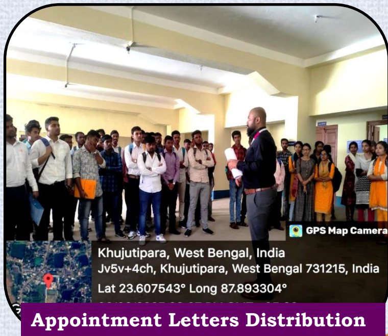
GPS Map Camera

Khujutipara, West Bengal, India Jv5v+4ch, Khujutipara, West Bengal 731215, India Lat 23.607543° Long 87.893304°