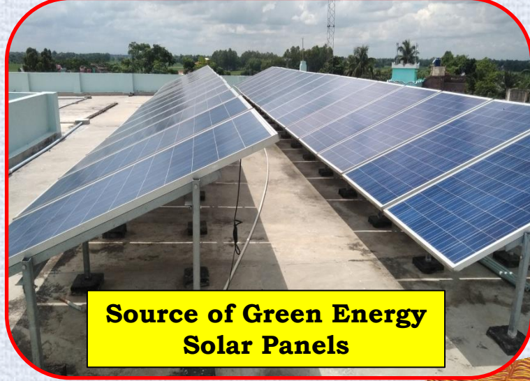
Source of Green Energy Solar Panels