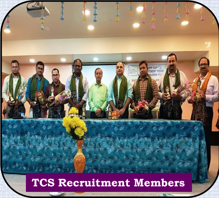
TCS Recruitment Members

A SPECIAL INITIATIVE TAKEN BY NANOOR DEVELOPMENT BLOCK & CHANDIDAS MAHAVIDYALAYA On 6 th March-2025