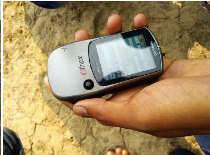
GPS filed survey in local agricultural field areas