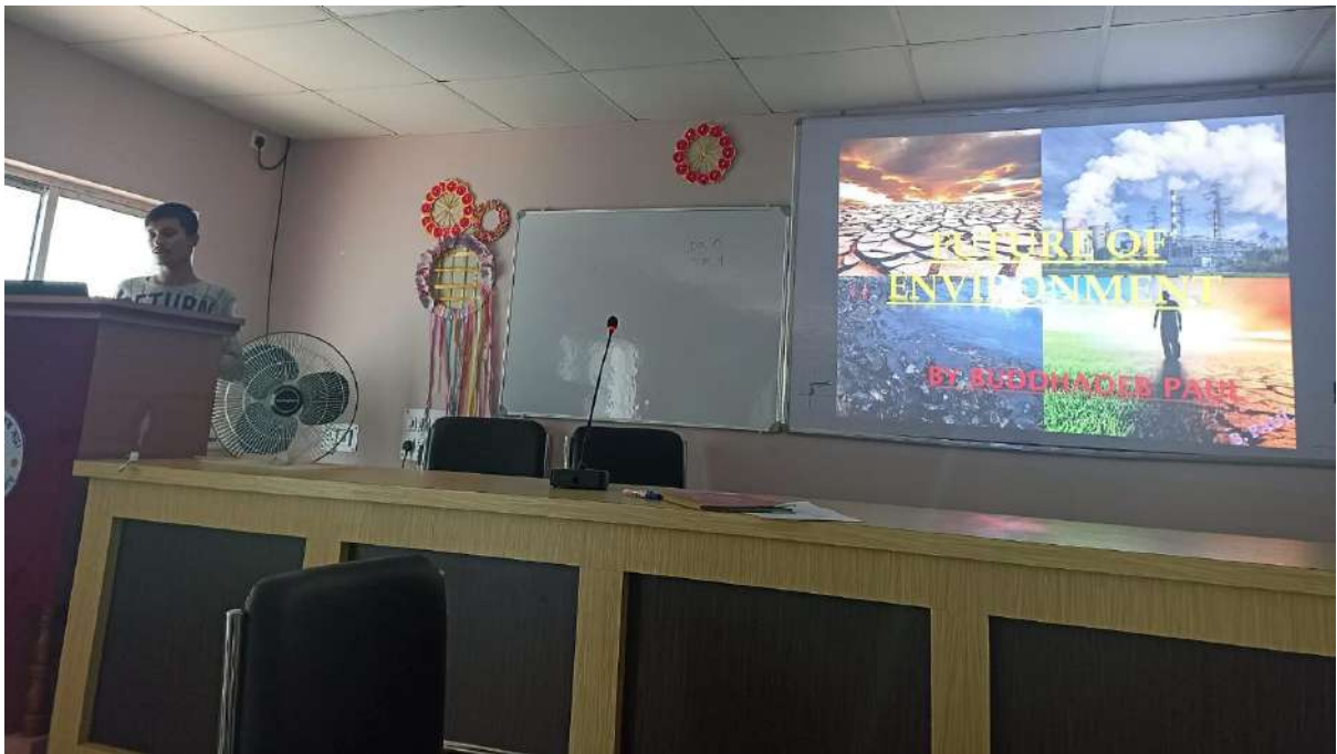
Students delivering Powerpoint Presentation during Students' Seminars