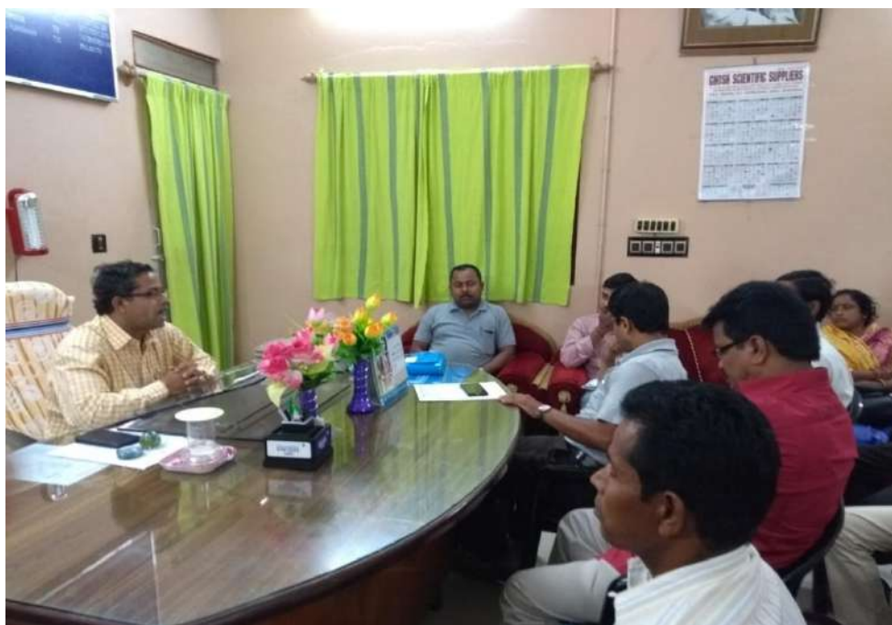
Parent-Teachers' Meeting at the Principal's Chamber (Date: 26.04.2018)