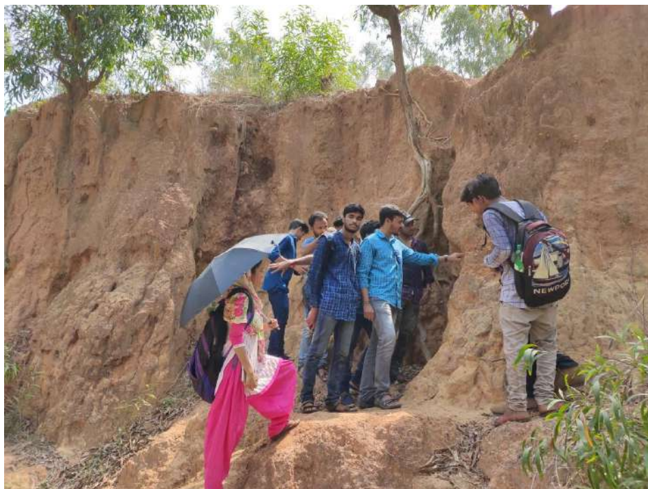
Course Outreach at Khoai Region (Lateritic Landscape) of Santiniketan, Birbhum.