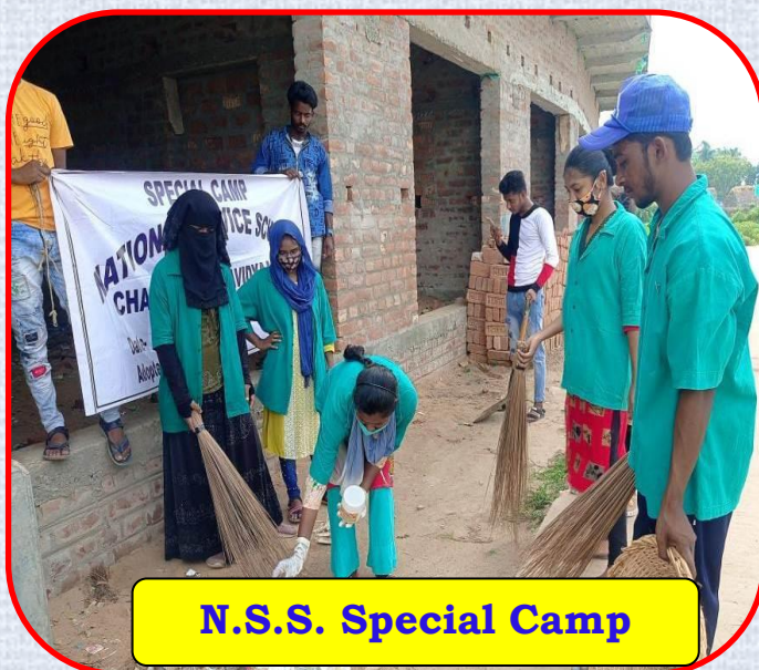
N.S.S. Special Camp