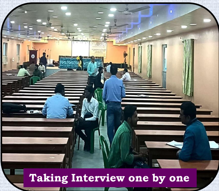
Taking Interview one by one