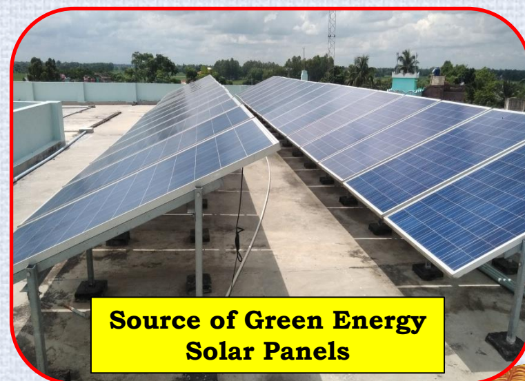
Source of Green Energy Solar Panels