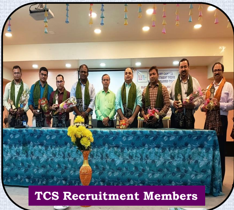
TCS Recruitment Members

A SPECIAL INITIATIVE TAKEN BY NANOOR DEVELOPMENT BLOCK & CHANDIDAS MAHAVIDYALAYA On 6 th March-2025