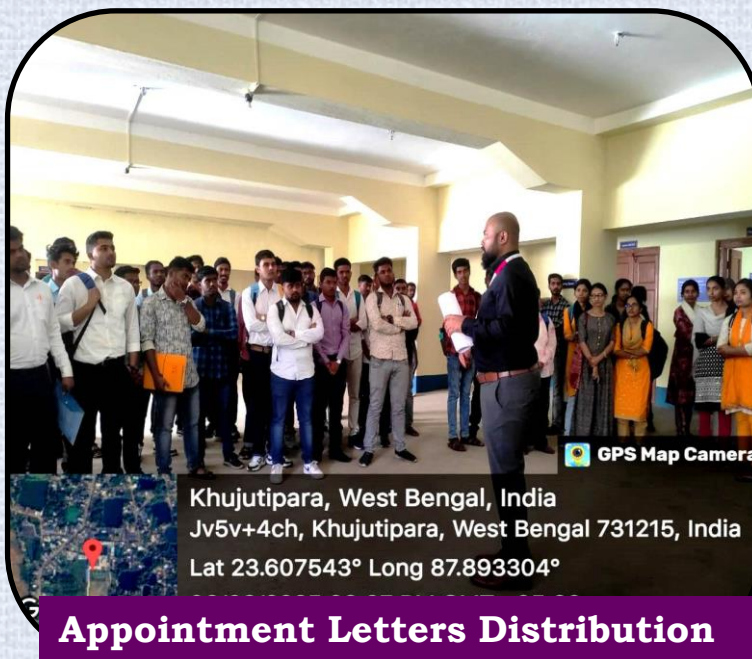
Appointment Letters Distribution

SEIZE THIS OPPORTUNITY MOST SINCERELY IN FUTURE